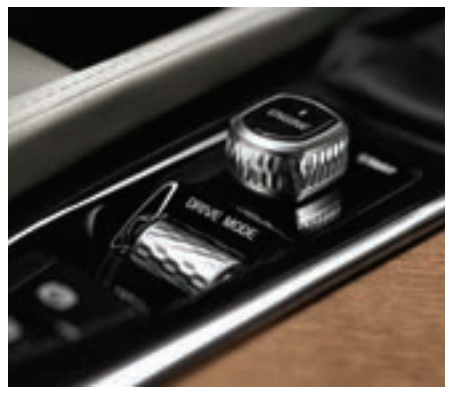
Jewel-like touches such as controls with diamond-knurled finish and translucent edges underline our designers' meticulous attention to detail.