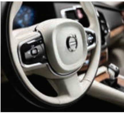
This is the first of a completely new generation of nimble Volvo steering wheels, combining a graceful rounded square in the centre with a contemporary interpretation of our classic three-spoke design.

The Volvo XC90's interior is truly special. It embodies our designers' vision to create a space that combines a contemporary take on luxury with timeless seclusion.