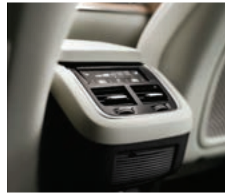
The four-zone climate system can be controlled from the centre display touch screen, or a graceful touch control panel at the end of the tunnel console.